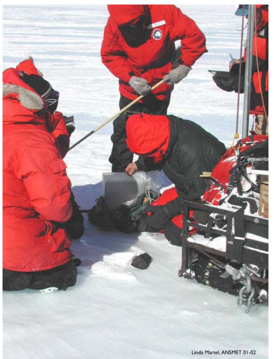
Figure 2: Recovery of a meteorite in Antarctica. The meteorite is picked up with sterile tongs and put into the clean Teflon bag. The recovery site is marked by a bamboo flagpole with the meteorite's field number, and the relevant data is logged into a notebook.

Meteorites start as meteors that are 'space rocks' that burn up or catch fire when they pass through the earth's atmosphere. These are seen as 'shooting stars' and most completely vaporize before they ever reach the earth. However an estimated 500 meteorites do reach the earth's surface every year, although many are very tiny, perhaps no bigger than a marble. It is believed that meteors fall uniformly over the entire planet.