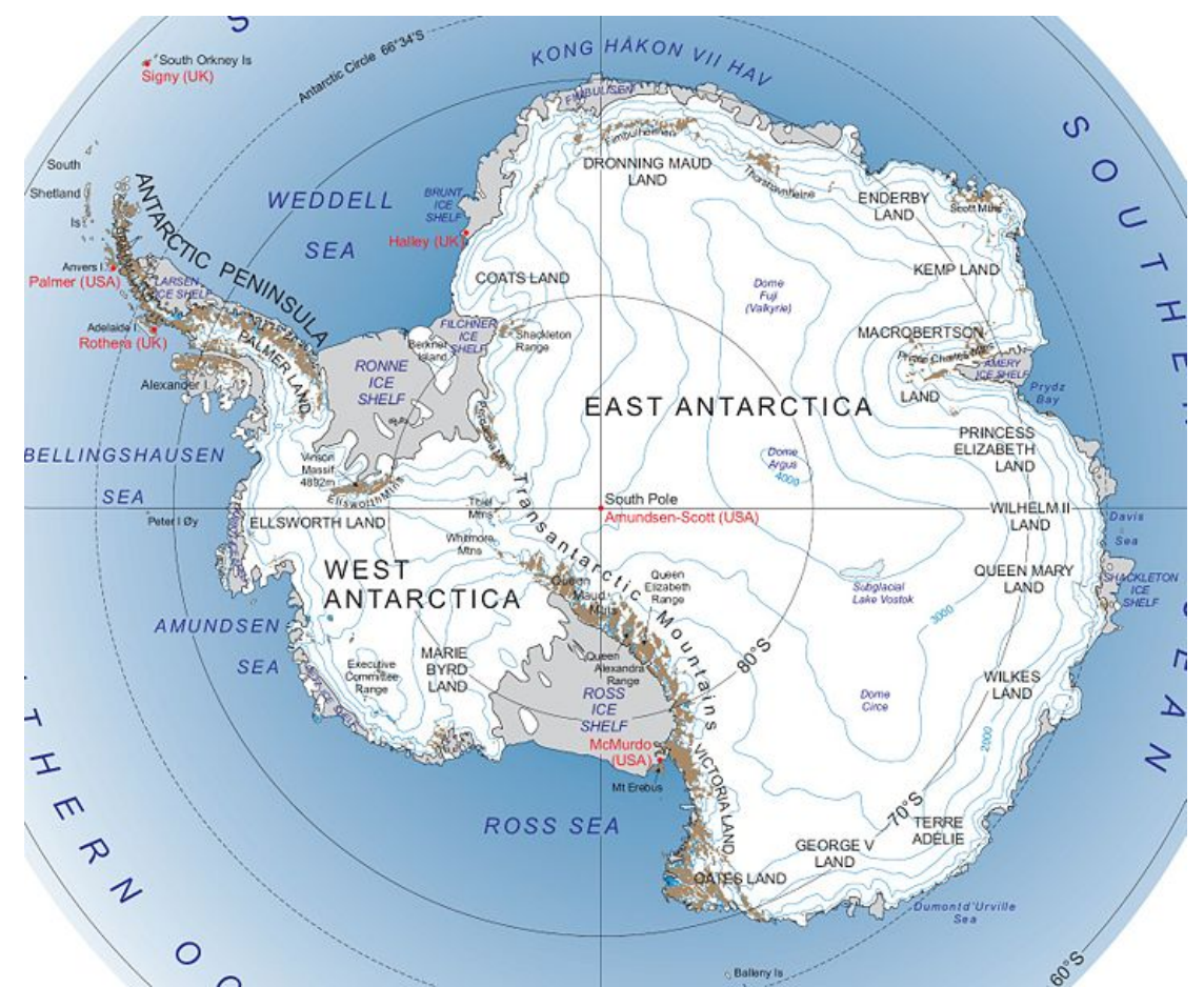
Figure 1: Transantarctic Mountains stretching from the Ross Sea to the Ronne Ice Shelf. The South Pole Quest will be passing through the mountain range where it is largely buried between the Ronne Ice Shelf and the South Pole.

In order to define the scope of the mountain range, scientists have been using radar to effectively peel away the covering of ice that envelopes the Transantarctic Mountains. Other mountain ranges in Antarctica lie fully covered by ice and were only discovered by employing radar techniques to reveal the topography below the ice. The Gambertsevs are sub glacial mountains found by a team of Russian scientists using radar technology. They are fully submerged in ice, and are thought to be the birthplace of the Antarctic ice sheet.